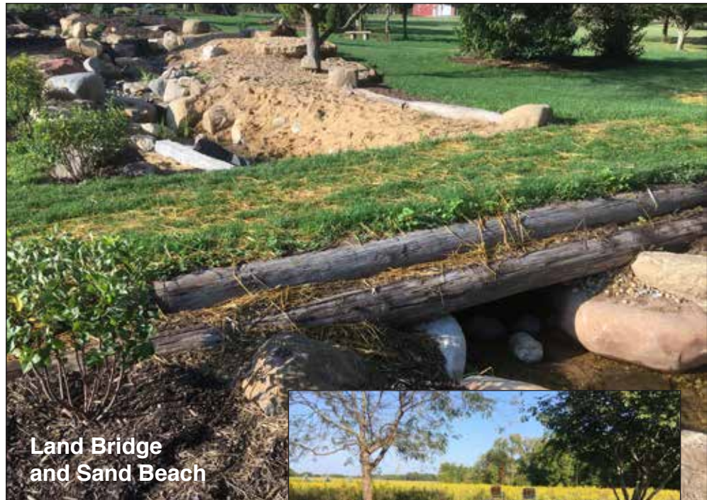
Land Bridge and Sand Beach

A sudden inspiration in Dave’s head, a pile of dirt, some telephone poles, and some wooden planks turned into the Prairie View Platform one recent afternoon. It’s a great place to get five feet above ground level and look down upon the Prairie. We are letting the dirt and poles settle before we secure it all together and seed it down, but it should be ready for use next spring.