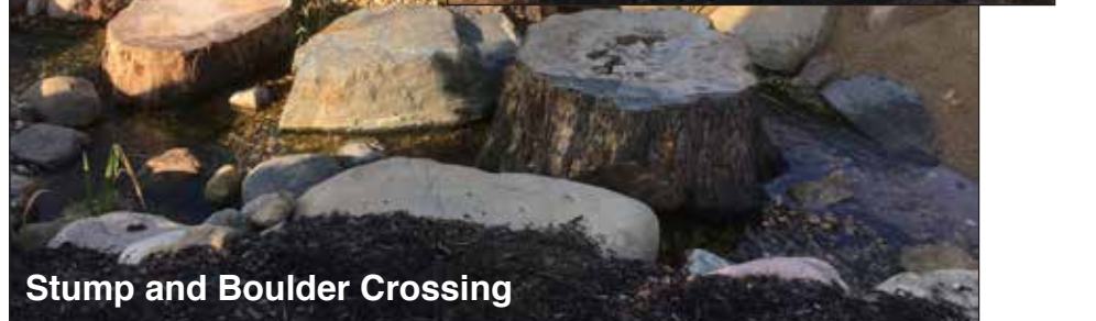
Stump and Boulder Crossing