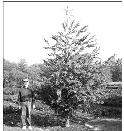
Rich beside a 10-year-old Dawn Redwood.